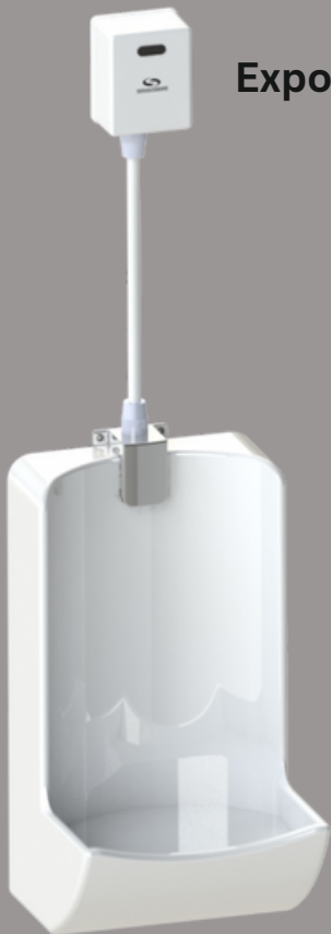
Exposable Sensor Urinal Unit